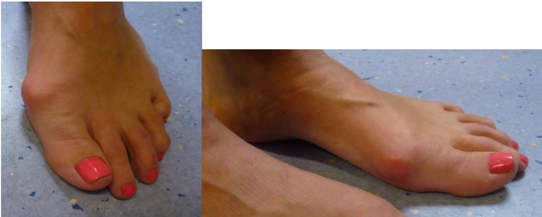
A Typical Hallux Valgus ('Bunion') Deformity

A bunion is the lay term for hallux valgus, or deviation of the great toe. The deformity is complex and involves the big toe long bone (metatarsal) to deviate away (inward) from the second toe and the big toe itself to deviate outward, toward the second toe. Due to this movement, a prominence on the inside of the foot (the 'bunion') occurs and can cause symptoms. Contrary to popular belief, it is not a new growth of bone.