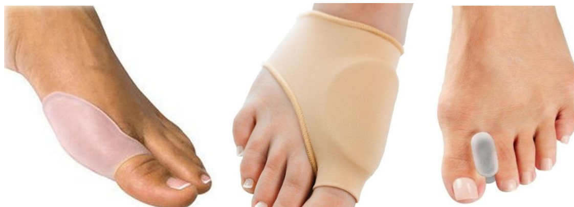
Bunion Pads (left and middle), Silicon Toe Spacer (right)

Surgery —If non surgical options fail to resolve symptoms, then surgery can be considered.