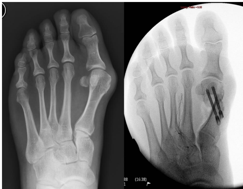
Before (left) and After (right) Minimally Invasive Bunion Surgery XRs.

You need to be able to control the vehicle in an emergency. Can you stamp your foot down on the ground? For left sided surgery and no clutch is required, driving is probably safe at 1-2 weeks post operatively. For right sided surgery, driving is probably safe at 6 weeks post operatively, once in a normal shoe. If you are unsure, please ask Mr Gordon.